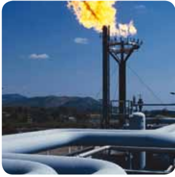
MATRIX-F FT-NIR spectrometer is ideal for in-line and on-line process monitoring.