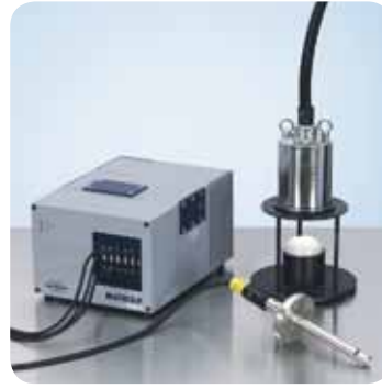
MATRIX-F duplex with fiber optic probe and measurement head.