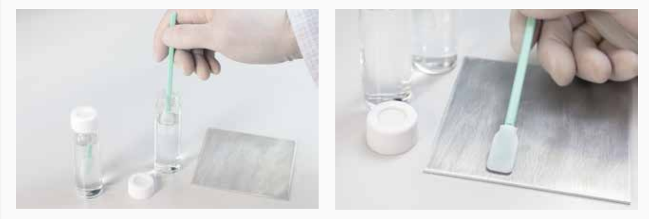
Figure 1a-b: Swab sampling on a test specimen, cross-wise in lanes

With the swab test (Figure 1a, 1b), on the other hand, previously defined risk locations, such as recesses, welding seams and obstacles, are purposefully sampled by using e.g., cotton or polymer fiber swabs. The swab material is moistened and rinsed with ultrapure water before and during the sampling. The sampling area, usually limited using a template (normally approx. 100 cm<sup>2</sup>) is wiped in layers cross-wise. The swab is then eluted/extracted with ultrapure water, by aid of shaking or sonication, topped up to a fixed volume of for example 40 ml and subsequently measured for TOC content.