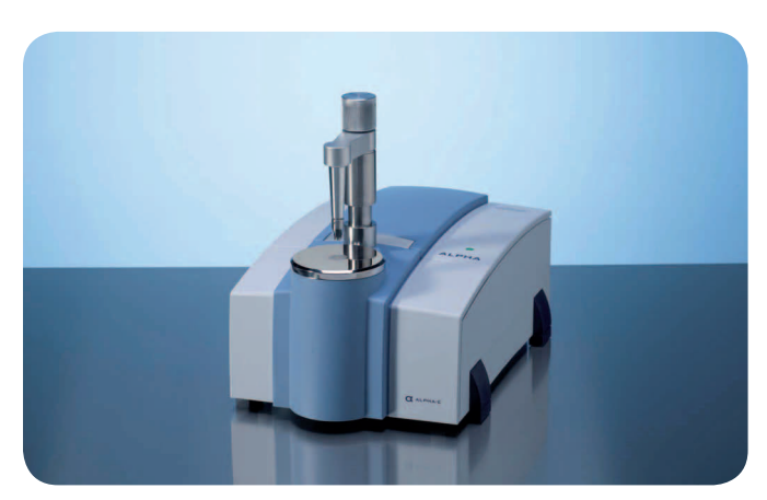
Figure 1: ALPHA-P high pressure with diamond ATR.

In everyday live there are many prominent examples of polyamides such as Nylon, Perlon or Aramid (Kevlar). Since polyamides are produced in large quantities recycling is also a major issue. Generally as thermoplastics polyamides can be recycled mechanically via thermal shaping but it is also possible to recycle them chemically e.g. via acid or base-catalysed hydrolytic depolymerisation. In order to get an acceptable recycling product a reliable method to differentiate between different polyamides is needed since the product quality depends on the purity of the recycling material. In this application note we will evaluate the use of Fourier transform infrared spectroscopy in combination